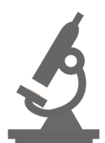
Precision electronic equipment